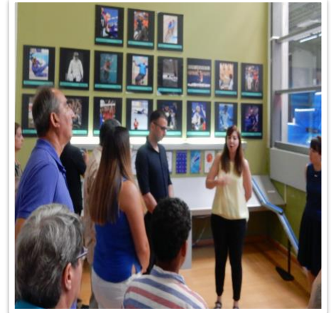
Participants at the Olympic Museum in Thessaloniki