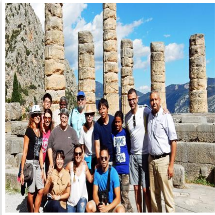
Some participants at the site visit at the archeological site in Delphi