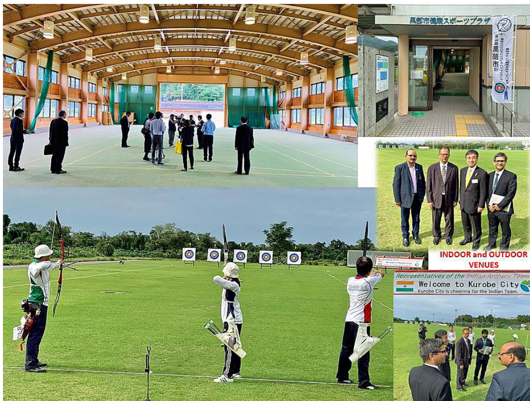
INDOOR and OUTDOOR VENUES

Next was the visit to the INDOOR ARCHERY ARENA which is connected to the Main OUTDOOR ARCHERY ARENA – 6-minutes by minibus; and the MAYOR explained each site with great detail and followed by Q&A by the Indian delegation. This served the first aim of the training camp- VENUES. The venues are excellent , as also determined by the Indian side and the environment is perfect; with beautiful green grass; and the availability of the indoor venue is also a plus point; additionally a prehab facility for the ARCHERS will be set up during the camp period. Three Japanese archers also demonstrated their archery skills and the bulls eye.