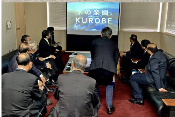
(Exchange of views and looking back at the days visits)