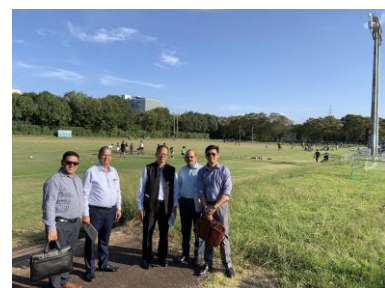
(UNIVERSITY of TSUKUBA – Faculty of HEALTH and SPORT SCIENCES – TAIKU; Tsukuba Science City CAMPUS)