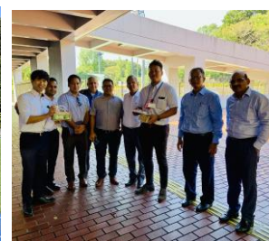
(CHUO UNIVERSITY TAMA CAMPUS) # Below page shows the meeting (International and the Olympic-Paralympic Project Promotion Office) and site visits to NSSU campuses