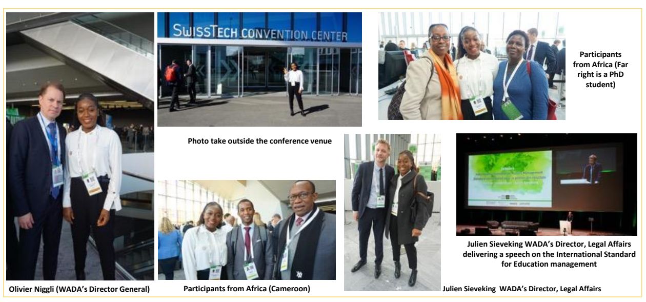
WADA, Lausanne - Images

Athlete education subsequently provides support and the required guidance to raise the necessary awareness among the target group.