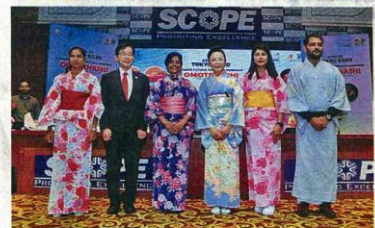
Indian officials & athletes wearing the traditional Kimono during a workshop held in New Delhi to help the Olympic contingent get familiar with Japanese culture