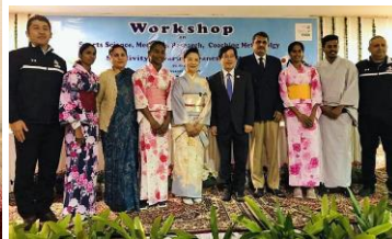
(Towards Tokyo 2020)