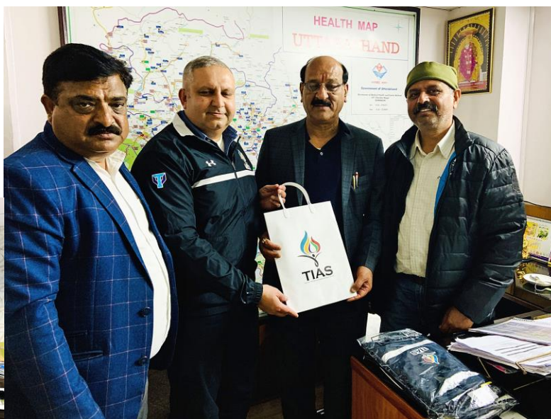
(above, Uttarakhand Cabinet Minister Uniyal, and IAS, Secretary Sundaram, with colleagues)

Location 2: Narain College, Shikohabad, UTTAR PRADESH (Total of plus 200 student's, scientists across disciplines and people in administration, including the area MLC, interacted with)