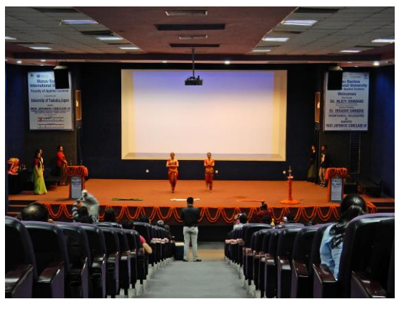
"Shall we - Cultural exchange / Japanese Culture and the Omotenashi Spirit"