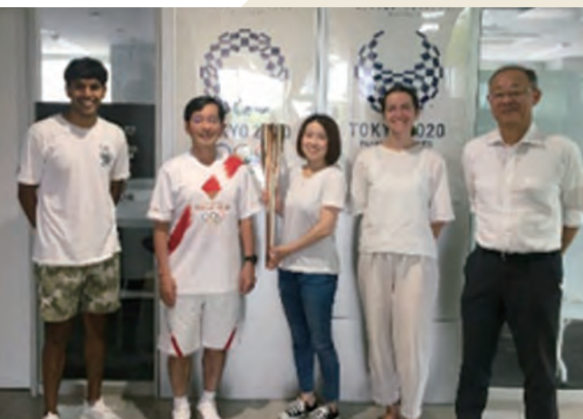
Tokyo Olympic and Paralympic Torch Relay