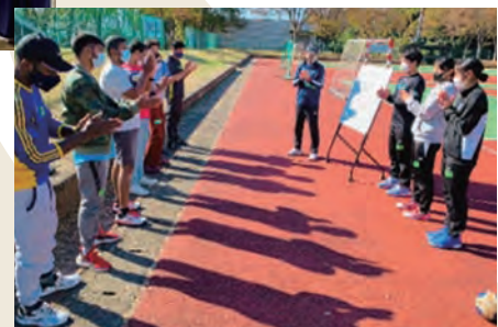
Interaction with athletic clubs