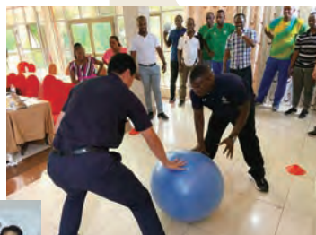
Exchange Program in East Africa